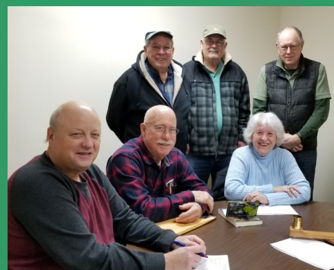
Building & Grounds Team Maintaining Westminster