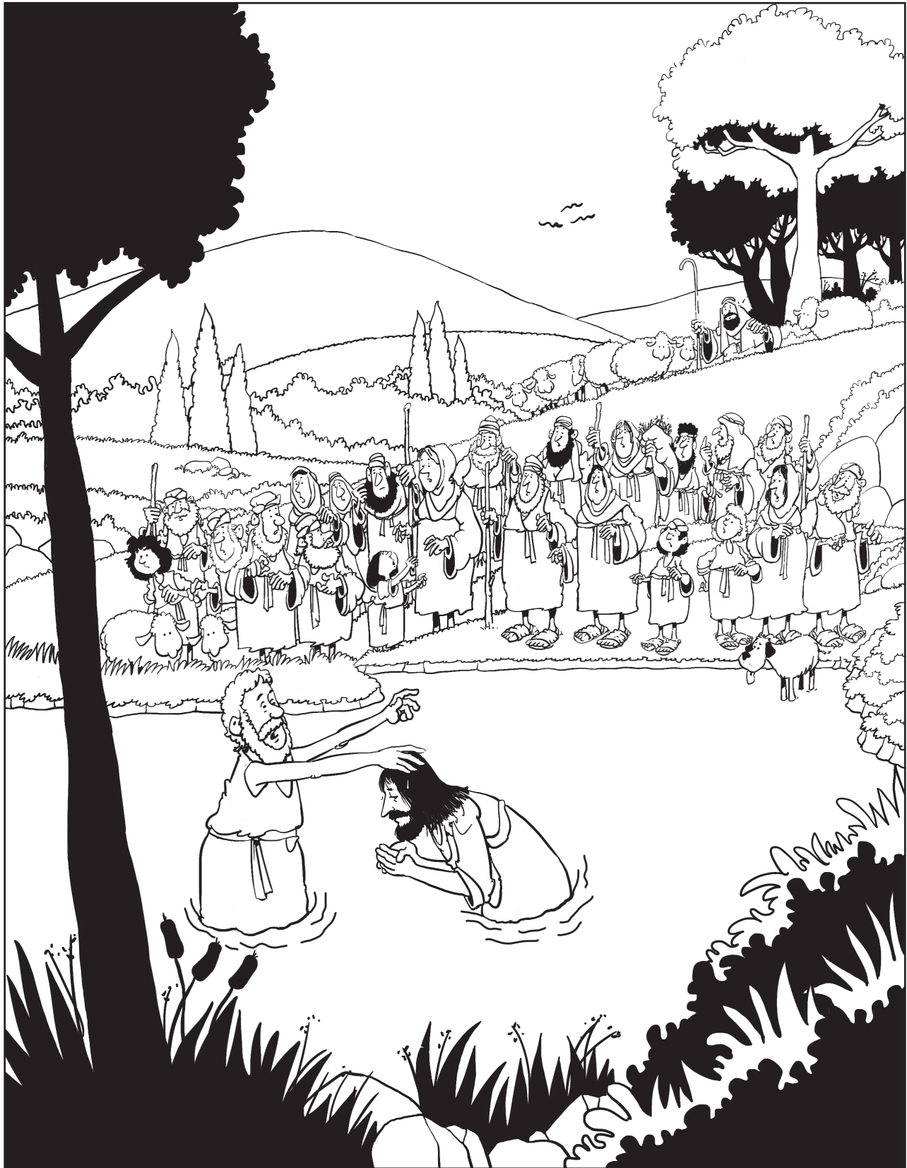
John baptizes Jesus. God is pleased.